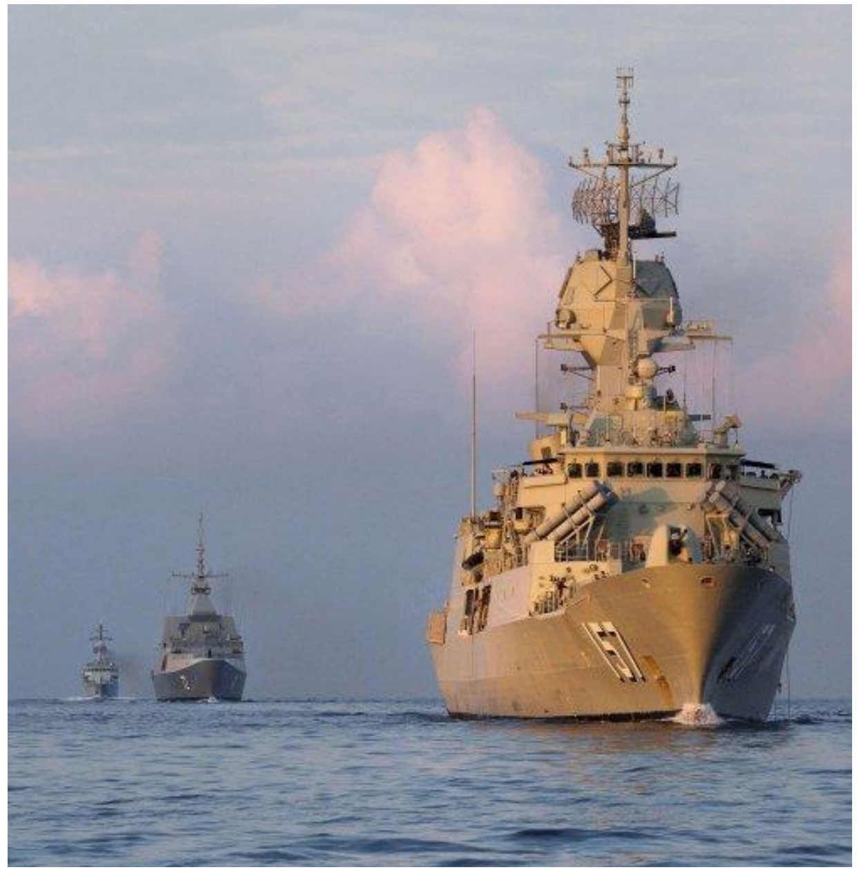
Royal Australian Navy Anzac-class frigate HMAS Perth (foreground) pictured with the Republic of Singapore Navy ship RSS Stalwart and Royal Malaysian Navy ship KD Kasturi (background) in the South China Sea during Exercise 'Bersama Shield 2015' on 29 May.

Crucially, yet to be determined is the design, number, build schedule and place of construction of the conventionally powered Future Submarine that will replace the RAN's six-strong Collins-class fleet under Project Sea 1000 Phase 1/2 at an estimated acquisition and through-life support cost of around AUD50 billion (USD36.5 billion).