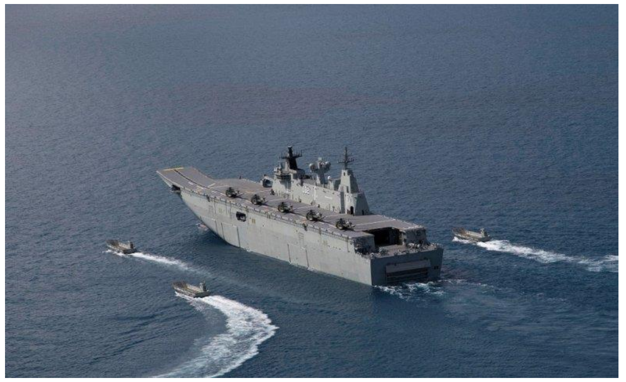
HMAS Canberra off the north Queensland coast with five MRH90 aircraft on deck and its four landing craft deployed.

Presumably at least partially driven by the escort needs of the RAN's new 27,500-ton Canberra-class landing helicopter docks (LHDs), Plan Pelorus moves the operational emphasis from independent units to grouping together the combat capability of ships in task groups.