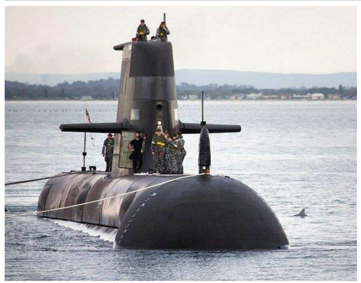
Collins-class submarine HMAS Rankin returns to Fleet Base West in Rockingham, Western Australia, after conducting a full-cycle docking activity in Adelaide, South Australia, on 1 October 2014. 1642800

This includes a change in the maintenance cycle from eight years in the water and three in a full-cycle docking (FCD) to 10 years in the water and a two-year FCD.