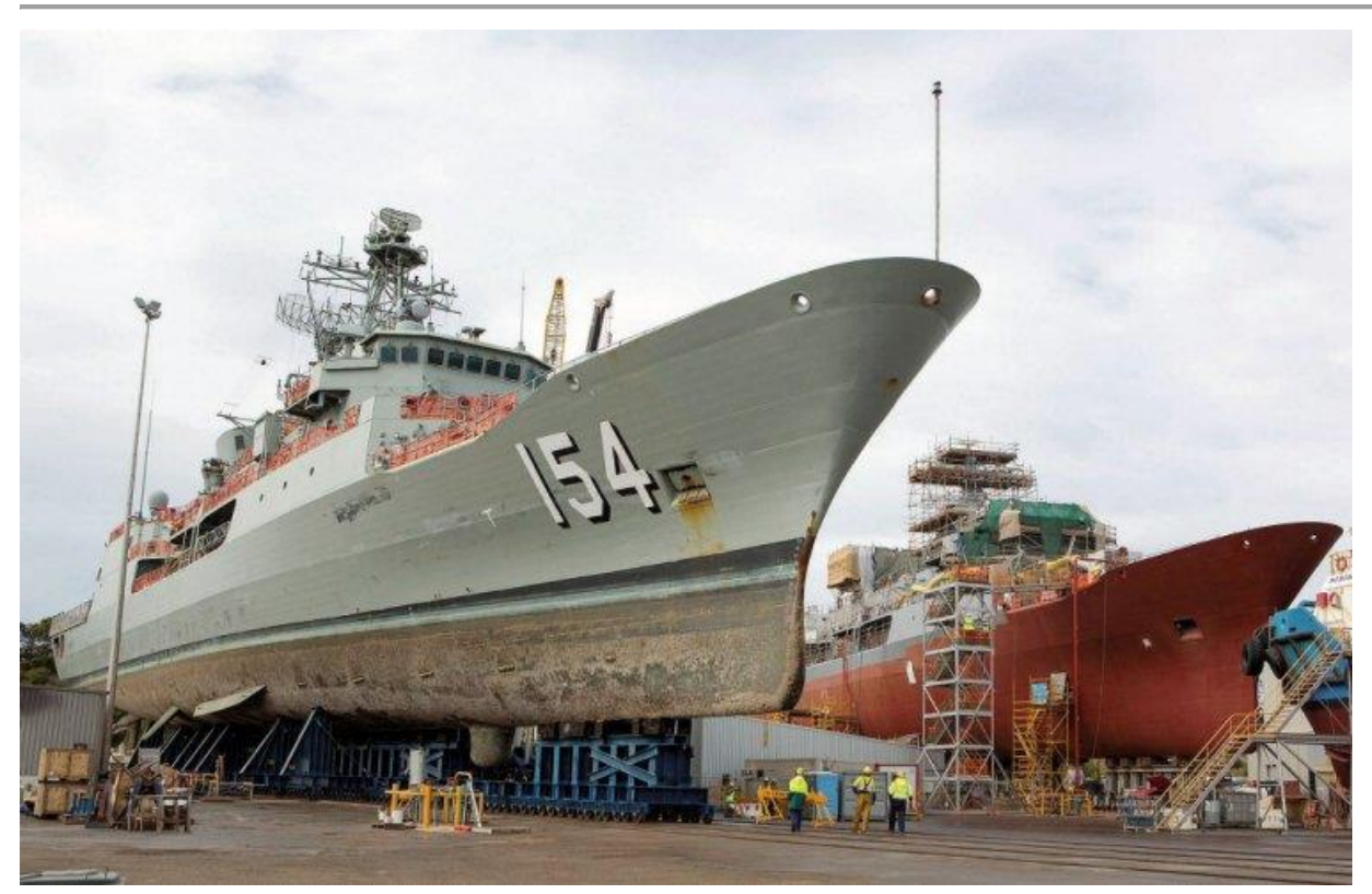
Fifth-of-class Anzac-class frigate HMAS Parramatta (FFH 154) docks at BAE Systems' Henderson shipyard in Western Australia on 29 April to begin its ASMD upgrade programme.