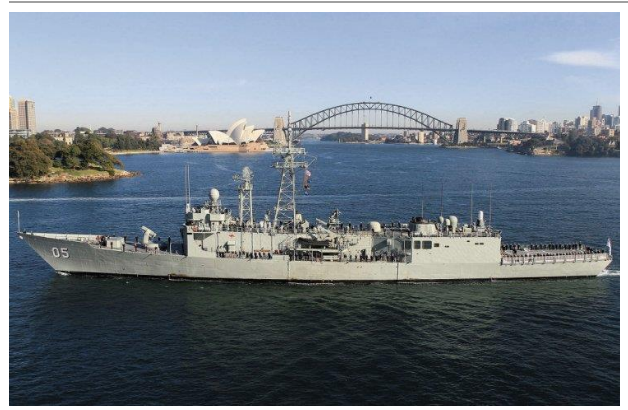
Adelaide-class guided-missile frigate HMAS Melbourne sails past Sydney Harbour Bridge and the Opera House on its return to its base at Garden Island, following a six-month deployment to the Middle East.