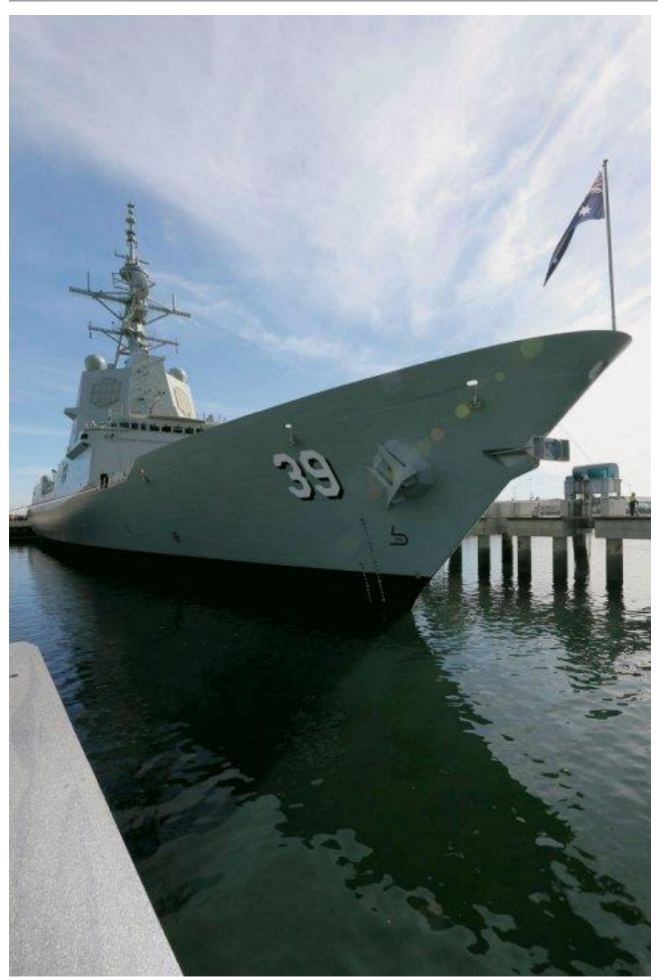
The first of three AWDs for the Royal Australian Navy, Hobart, was launched on 23 May.

Fast forward to 2018 and these assets - probably minus the third FFG - will have been joined by the first of three Hobart-class Air Warfare Destroyers (AWDs), a second LHD, 24 MH-60R maritime combat helicopters, and six MRH90 maritime support helicopters.