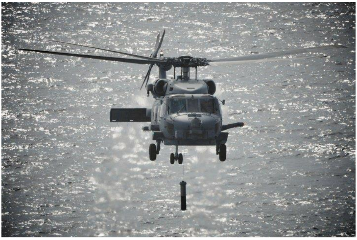
A Royal Australian Navy MH-60R maritime helicopter conducts functional testing of its newly fitted AN/AQS-22 Airborne Low Frequency Sonar System off the coast of Jacksonville, Florida, on 13 May 2014. As well as supporting the detection, tracking, localisation, and classification of submarine threats, the AQS-22 also performs acoustic intercept, underwater communications, and environmental data acquisition.

In addition to a Lockheed Martin 48-cell Mk 41 vertical launch system accommodating the SM-2 Block III and quad-packed ESSMs, the AWDs' armament includes two four-canister Boeing AGM-84 Block II Harpoon anti-ship missile launchers; the US Navy's Mk 34 Gun Weapon System, which includes a single BAE Systems Mk 45 Mod 4 62-calibre 5-inch gun; a Raytheon Phalanx Block 1B aft-facing close-in weapon system; two ATK M242 25mm Bushmaster autocannons in Rafael Typhoon mounts; and two Babcock Mk32 Mod 9 twintube launchers for Eurotorp MU90 lightweight anti-submarine torpedoes.